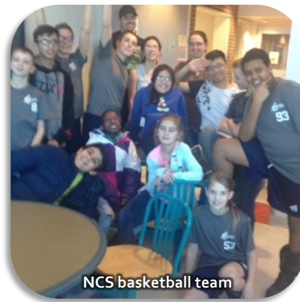
NCS basketball team