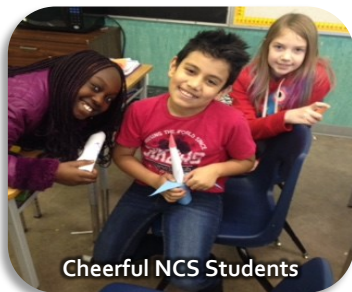
Cheerful NCS Students

Newell Christian School is a K - 9 rural school located between the city of Brooks and the village of Duchess. It sits on a ten-acre parcel of land near the Trembecki subdivision close to Highway 36. Students are bussed to NCS from all over the county of Newell, many coming from farms and acreages in the area. The culture at the school is diverse and the atmosphere inviting.