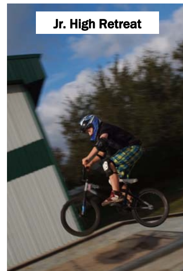
Jr. High Retreat